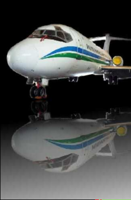
Aviation Regulation Services

GACS provides professional services pertaining to legislation in the following areas: