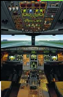
Technical Support Services

Engine repair/refurbishment against work scope. Aircraft major check against work package.